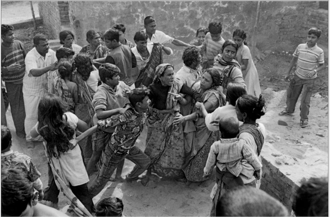
A WRANGLE BETWEEN TWO FAMILIES IN KAMRANGIRCHAR PRODUCED LOTS OF NOISE AND SOME BLOWS BUT, AS USUAL, DREW NO BLOOD. WOMEN WERE BY FAR MORE AGGRESSIVE THAN MEN.