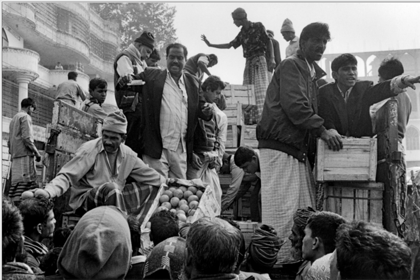
A TRUCK WITH ORANGES SURROUNDED BY SMALL RESELLERS IN BABU BAZAAR.