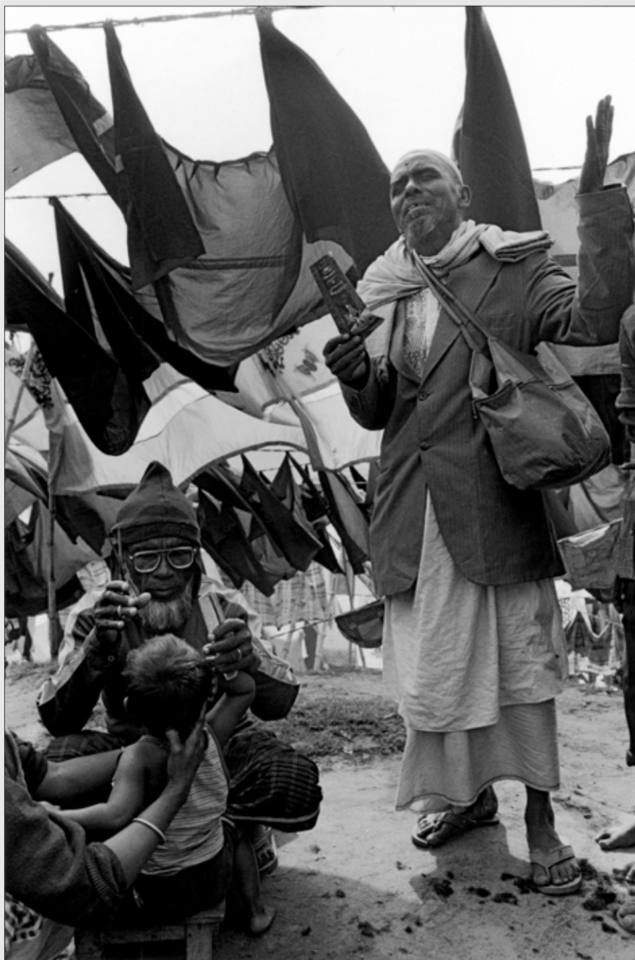
COIFFEUR IN HAZARIBAGH REMOVES NITS FROM BOY'S HEAD WITH ASSISTANCE OF A SINGER IN RELIGIOUS REPERTOIRE